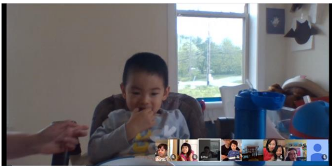
5/17 九班遠距教學。9 th Grade Distance Learning