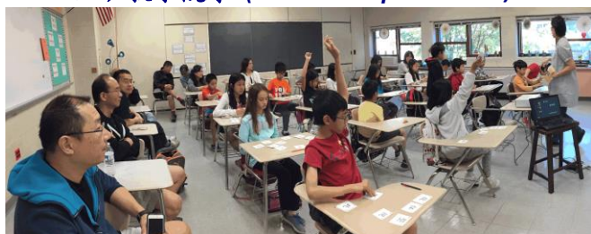
10/22 五班教學觀摩 (5 th Grade Open House)