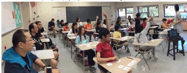
10/22 五班教學觀摩 (5 th Grade Open House)